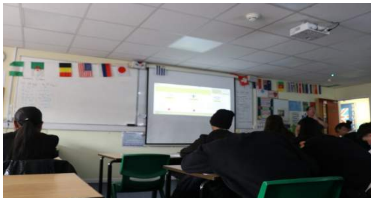
Ms Burton captivating her students on diverse religious perspectives that influence believer's actions!